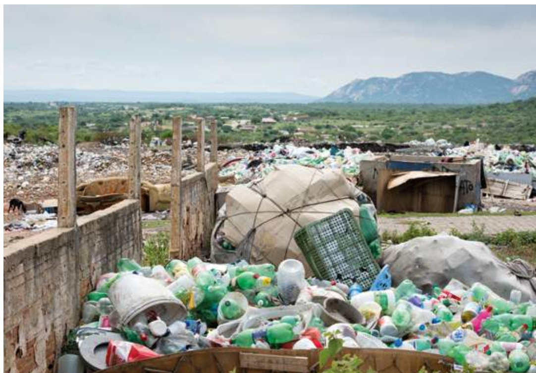
📷 A municipal waste dump in Brazil.