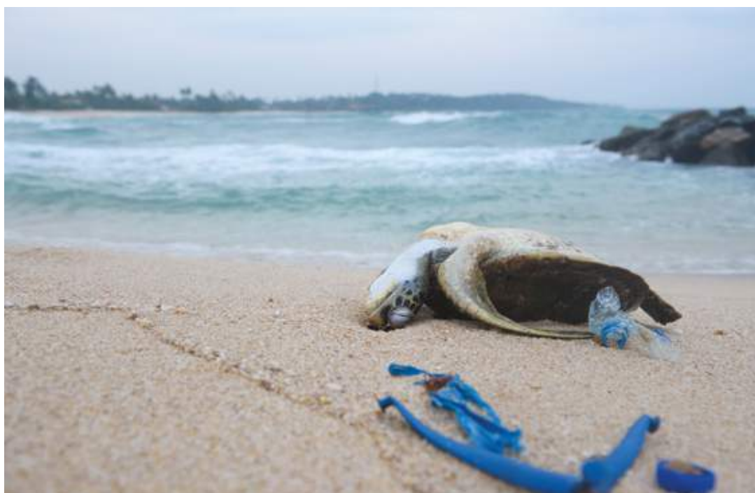
📷 Dead sea turtle among ocean plastic waste.

The conditions of the marine environment cause plastic to break up into smaller and smaller pieces that are easily ingested by marine animals, who can mistake them for food. 27