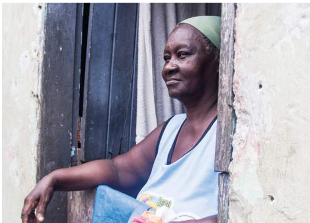
Community member in the Coqueiral neighbourhood of Recife, Brazil, whose house regularly floods due to waste blocking the river and more frequent rains.

Things look extremely bleak if the world continues with business as usual.