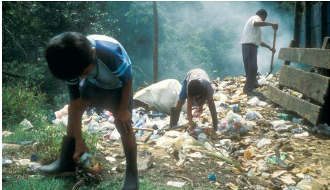
📷 Children working at a rubbish dump in Livingstone, Guatemala.

These groups can exhibit high levels of entrepreneurship, resilience and ingenuity. However, their work is unregulated and waste pickers are often a vulnerable demographic – typically women, children, the elderly, the unemployed, or migrants. 122 They also face considerable challenges: unhealthy conditions, lack of social security and health insurance, fluctuations in the price of recyclable materials, lack of educational and training opportunities and strong social stigma. 123