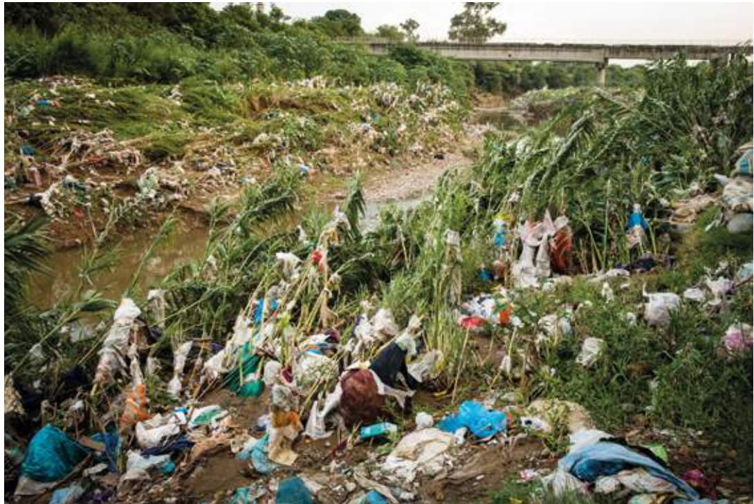
📷 Plastic waste litters river banks and open spaces around the globe.