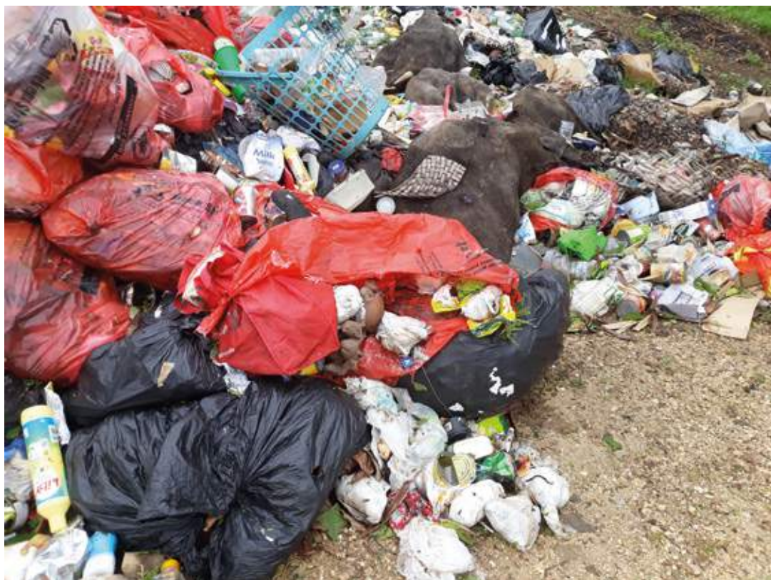
📷 Nappies in discarded waste in Vanuatu, South Pacific.

According to the UN, living among uncollected waste doubles the incidence of diarrhoeal disease . 67 In many countries, it is common practice to dispose of child faeces as part of the household rubbish – either in plastic bags or in disposable nappies. 68 Faeces may also be in the environment through flooding caused by blocked drains and waterways (as mentioned previously).