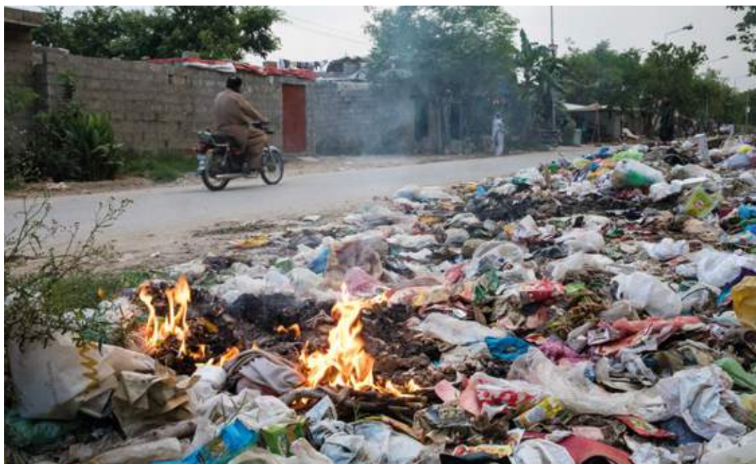
🗑️ Toxic fumes are released from burning plastic, but many communities have no other options to get rid of their waste.

In Ethiopia, a study showed that children from slums with uncollected waste were six times more likely to suffer from acute respiratory infections than those living where there were regular waste collections. 79