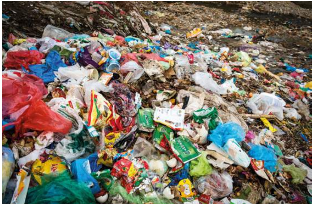
📷 Urgent action is needed to tackle the waste crisis.