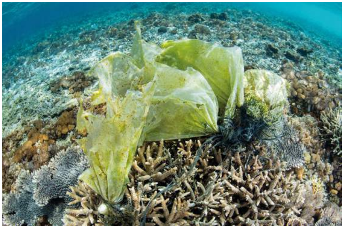
📷 A plastic bag on a coral reef.

These impacts threaten the long-term viability of reef ecosystems including reef-based fisheries, which are important for coastal communities. We discuss this impact on livelihoods in chapter 3. The scale of the problem is alarming. An estimated 11.1 billion plastic items could be entangled on coral reefs across the Asia-Pacific, with a projected increase of 40 per cent by 2025. 38