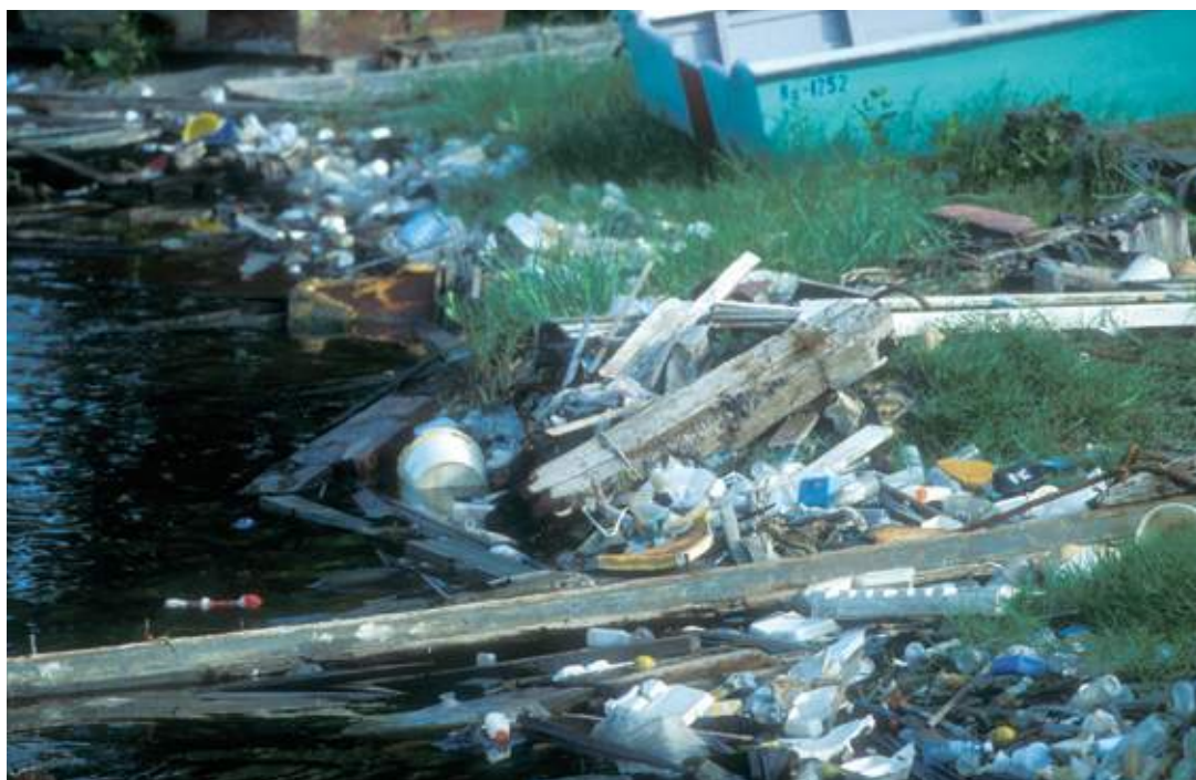
📷 Plastic pollution in Guatemala.

Plastic pollution is also wreaking havoc on land as plastic litters fields, waterways, hedgerows and trees across the globe. Some plastics are extremely persistent in the environment with studies suggesting that certain plastics can take thousands of years to decompose in the environment. 39 This contaminates soil and water and poses significant ingestion, choking and entanglement hazards to wildlife on land, and in freshwater systems as well as in the ocean. There is evidence suggesting that the impacts of microplastics on freshwater animals can be as diverse and harmful as those for marine species. 40 According to recent studies, microplastics in terrestrial environments could affect animals that play a major role in key ecosystem processes, such as soil organisms or plant pollinators. 41 The transfer of plastic debris along food chains has also been demonstrated for terrestrial systems, 42 which could have implications for human health (see chapter 2).