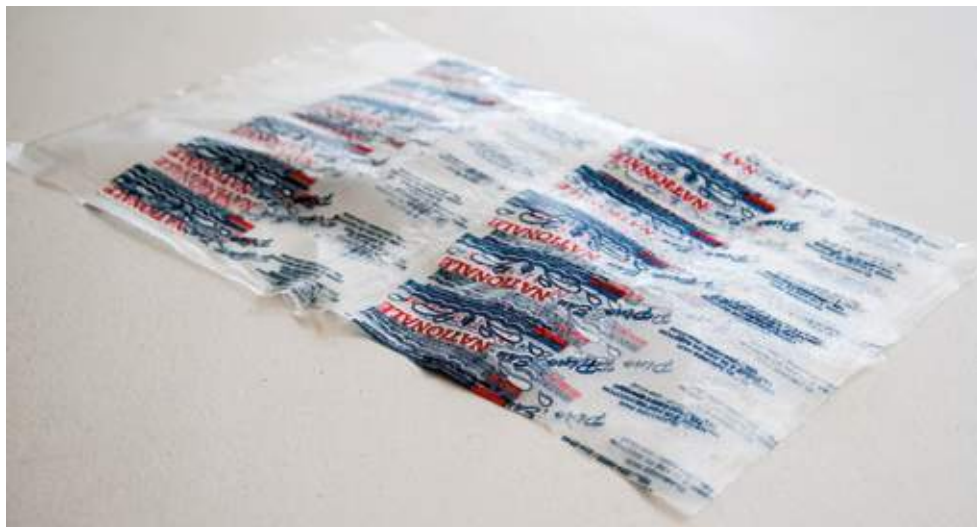
Water sachets such as these are ubiquitous in many low-and middle-income countries.

An immediate solution to this problem is for the LDPE sachets to be collected and recycled. However, the obvious longer term – more economically and environmentally sustainable – solution is for governments and donors to also increase investment in water, sanitation and hygiene (WASH), which will mean people can access safe water without having to buy it in plastic sachets.