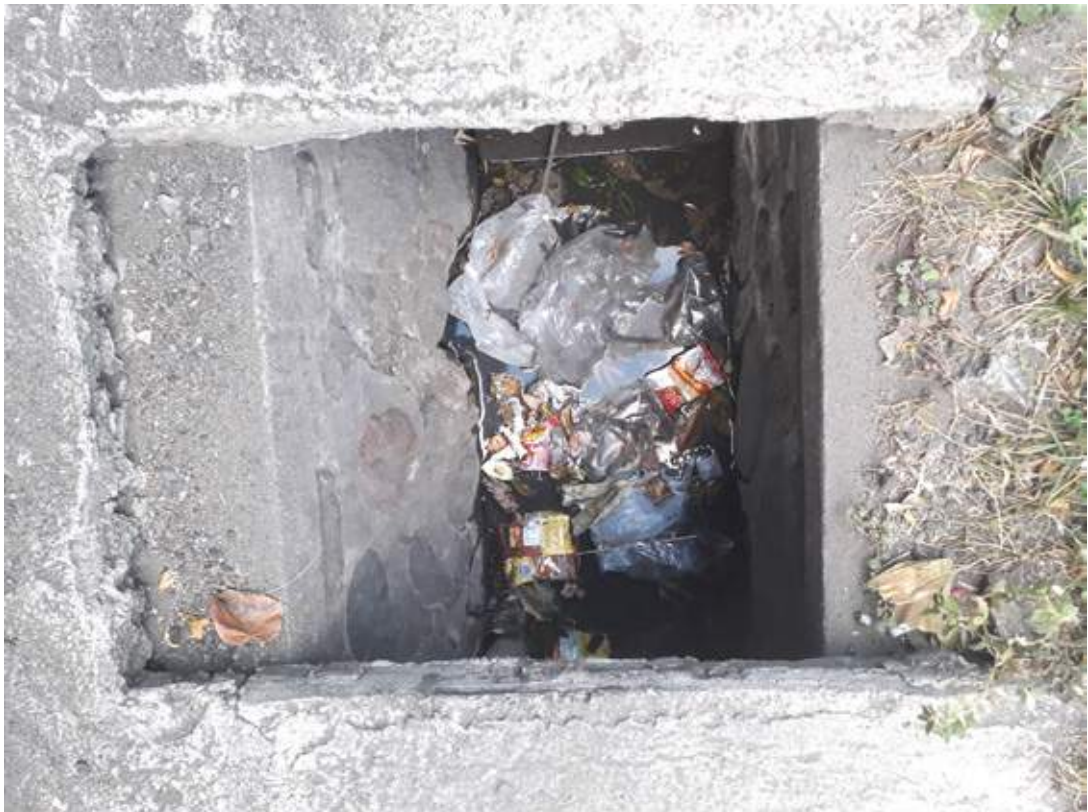
📷 Mixed plastic pollution – including plastic bags – in a storm drain, Bali. A growing number of countries have bans or taxes in place for single-use plastic bags.

Governments can also provide incentives for innovative product design that aims to reduce the plastic content of products or improve recyclability, along with shifts to viable alternative, non-plastic materials (while being aware of the negative impacts that some proposed alternatives may have); 205 and they can incentivise the use of reusable and refillable items (such as food containers and drinking bottles), through awareness, subsidies for refillables and levies for non-reusable items through the supply chain.