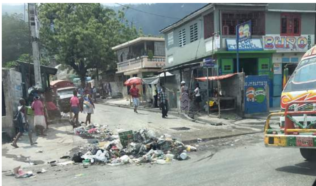
📷 In the absence of integrated sustainable waste management, waste collects in streets and public spaces in low- and middle-income countries. Port-au-Prince, Haiti.

In Maputo, Mozambique, a rapid increase in collection rates was achieved by inviting small community-based companies to provide waste collection in hard-to-reach areas, with collection fees staggered by income level. The city now has a collection rate of 80 per cent, one of the highest in its income group and a 'phenomenal achievement' according to the Global Waste Management Outlook . 197