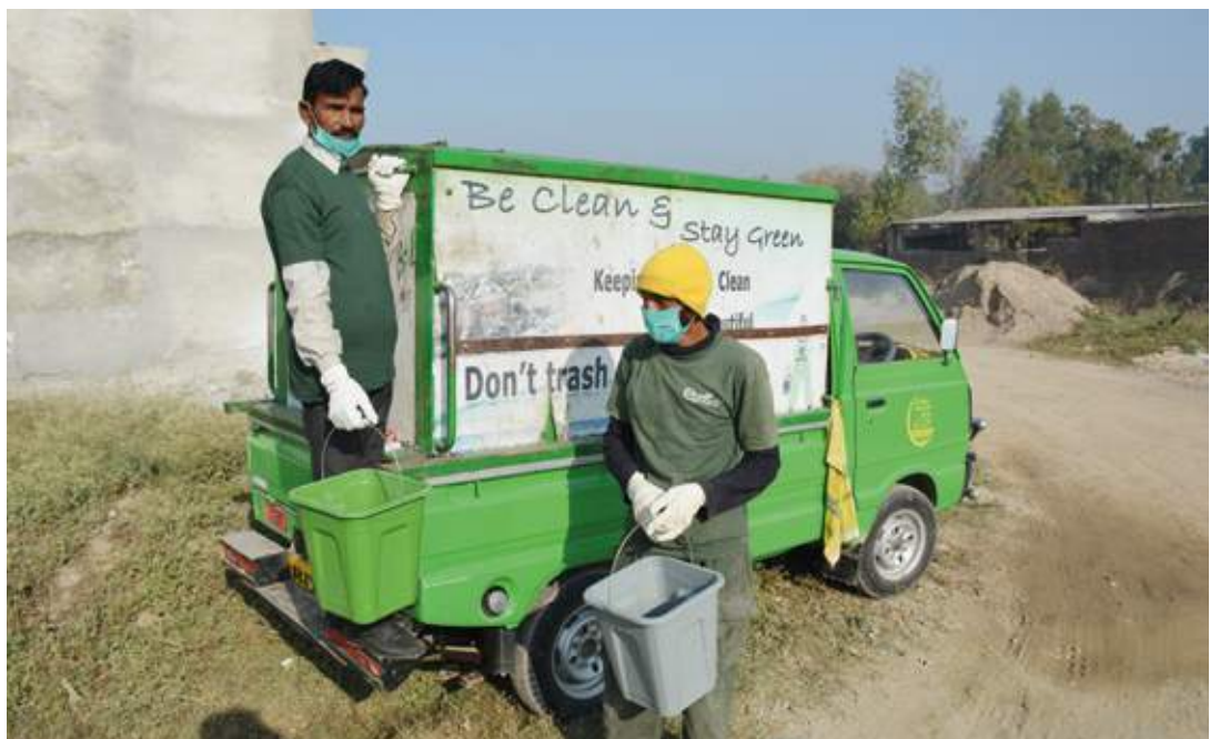
📷 'Environment guards' collect household waste and transport it to the IRRC in Islamabad.

When starting a project such as the IRRC, it is important to make sure no harm is done to those already working informally as waste pickers. Instead, the centre makes sure it employs existing local waste pickers among its staff, providing them with safer and better-paid employment. The centre calls their waste workers 'E-guards' (Environment guards) and supplies them with a protective uniform, giving them dignity and respect in the community.