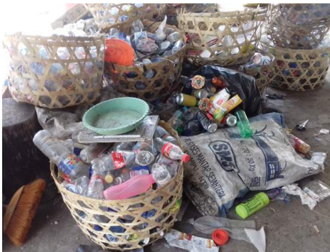
📷 Beach litter collected in Bali.

As many as 820 million people directly and indirectly rely on fisheries as a source of income to support food security, 97 so the human impact of these changes could be vast. Despite this, very little research has been conducted to assess the impact of plastic pollution on fishing communities. As long ago as 1992, the negative impacts of plastic pollution and marine debris on small-scale subsistence fishing communities and livelihoods were documented in Indonesia. 98 The study found that plastic waste impacted fishing activities through propeller entanglements, damage to fishing gear and injuries to people. The most direct impact was a decreased yield of fish caused by plastic pollution. But there were also indirect costs – increased expenditure (for example for repairs or for medicine for an injury) or an increased amount of time spent on fishing or fishing-related activities. The report also highlighted that for fisherfolk living at the subsistence level, even a minor decrease in fishing yield can mean that they cannot provide for their own basic needs such as food.