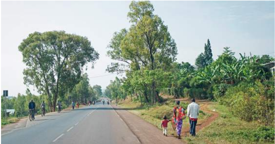
📷 The route from Kigali to Eastern Province, Rwanda. Kigali is now considered by many to be the cleanest city in Africa.

Rwanda outlawed the use of non-biodegradable plastic bags in 2008. At the time, many people asked: 'Is this really necessary? Surely Rwanda has bigger and more important things to worry about?' A few years before that, though, farmers were losing their livestock to plastic bags at an alarming rate. Rivers, streams and drains were blocked by plastic bags. Even farmers' fields were choked by these bags.