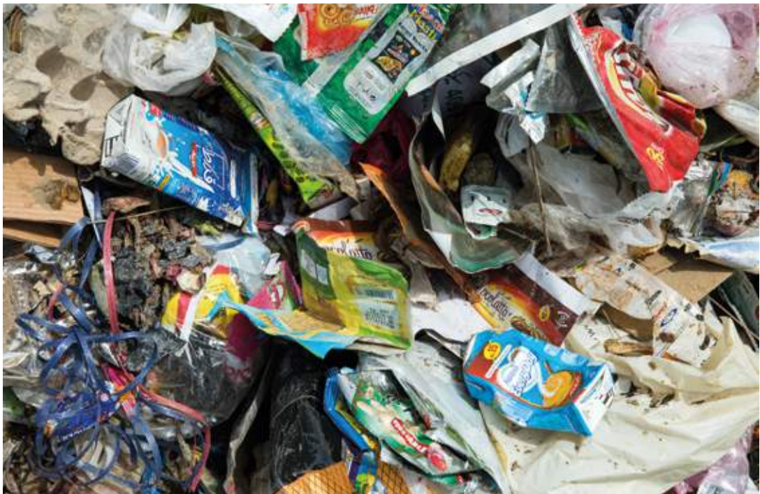
📷 Lays chips top right, owned by PepsiCo and Everyday milk at the bottom, owned by Nestlé, in packaging collected by the Community Recycling Centre in Islamabad, Pakistan.

There are many problematic single-use plastics being distributed by MNCs in low- and middle-income countries where there are inadequate or non-existent waste management systems. Here we highlight two examples: sachets and PET bottles.