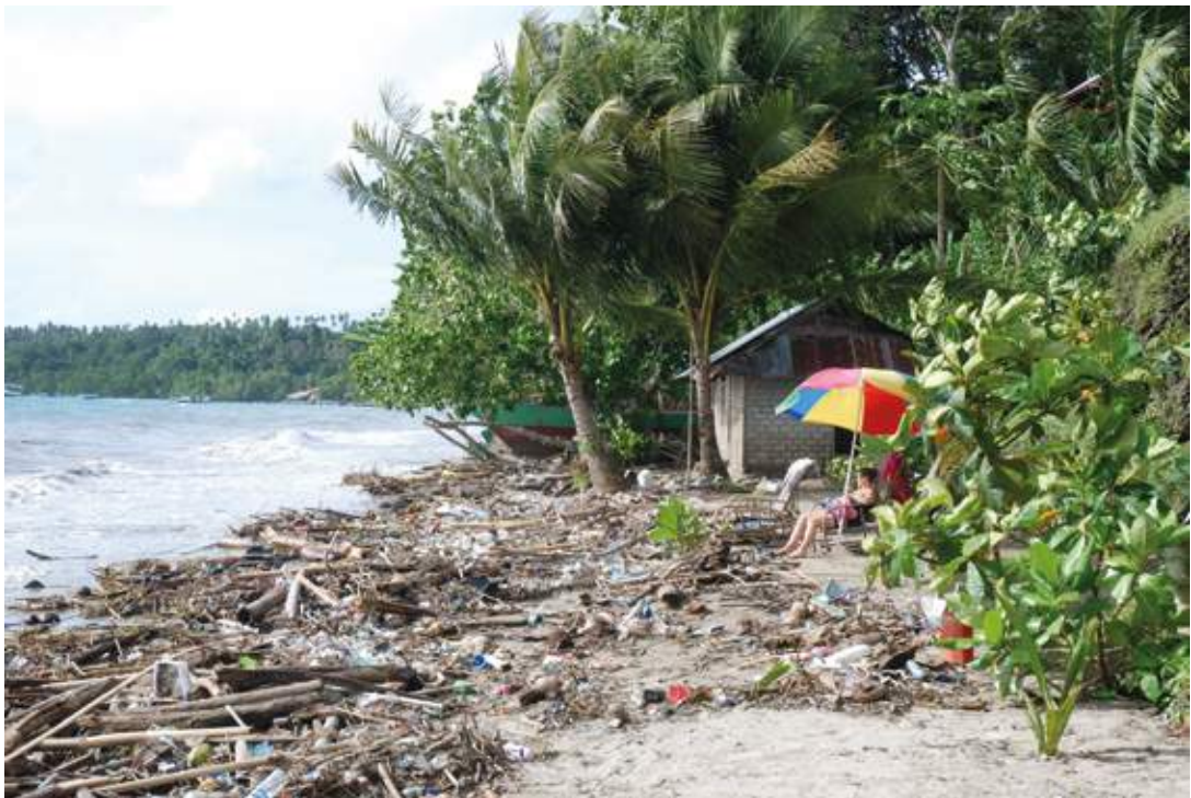
📷 A beach covered in plastic waste, Bunaken Island in North Sulawesi, Indonesia.

This field of research is still in its infancy, but it is already clear that plastic pollution in the ocean and on land has a direct impact on the livelihoods of people who are poor. In this chapter we explore the impacts of plastic pollution on livelihoods in three key sectors for many low- and middle-income countries: agriculture, fisheries and tourism.