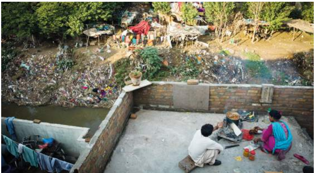
Many communities in low- and middle-income countries have no safe way to manage their waste.

In this chapter, we explore the health impacts of the plastic and waste crisis in more detail. We highlight five core ways the health and lives of billions of poor and vulnerable people – particularly children – are put at risk by mismanaged household waste. We also highlight a sixth potential health hazard, which is potentially huge, but as yet little understood: the introduction of microplastics into the food chain.