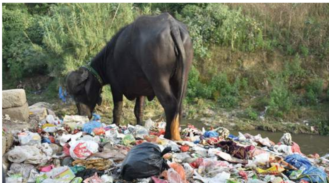
📷 A buffalo roams freely on a waste-covered river bank in Pakistan.

When plastic litters hedgerows, fields and waterways, animals can mistake it for food and eat it. Studies have found that up to a third of cattle and half of the goat population in the Global South have consumed significant amounts of plastic. 91 Research on abattoirs in Kenya shows that cows with plastics in their digestive system are a daily occurrence. In one case, a slaughtered cow had 2.5kg of plastic waste in its digestive system – about the same weight as a laptop. 92 When plastic is swallowed by animals, it does not decompose in their digestive tracts and cannot move through their guts. It leads to bloating, a host of adverse health effects and eventually death by starvation. 93 Alongside the evident suffering this causes the animals, this has dire economic consequences for farmers. 94