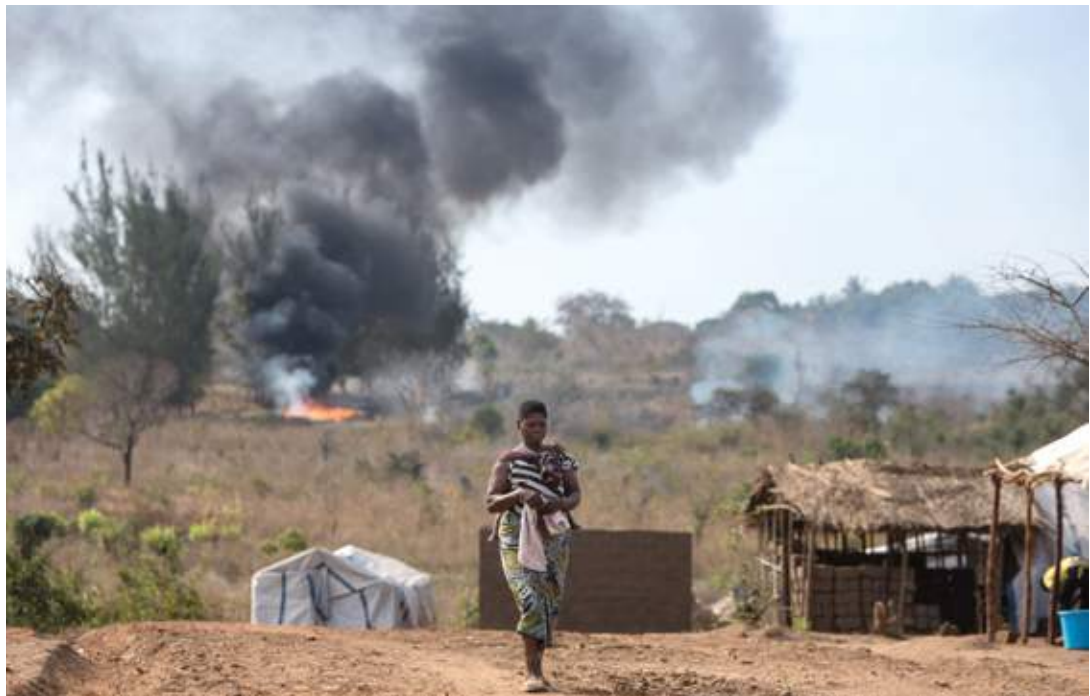
📷 A woman and her baby with burning rubbish behind her in the Mocuba District of Mozambique.

Plastic pollution is also contributing to climate change . While global plastic production emits 400 million tonnes of greenhouse gases each year (more than the UK's total carbon footprint), according to the World Bank solid waste was responsible for a further five per cent of global emissions in 2016. The true figure may be much higher: emissions from backyard burning of waste are not included in most current emissions inventories, despite research revealing that in several developing countries they dwarf all other sources of carbon emissions combined.