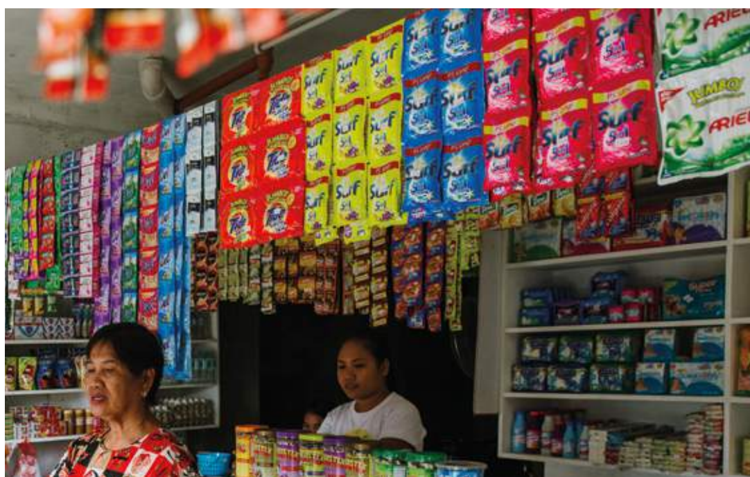
📷 Non-recyclable plastic sachets are sold in huge quantities across many low- and middle-income countries.

But while sachets may bring convenience, and – in some places – a level of affordability, they are a significant contributor to the waste crisis in many poor contexts. In Tearfund and WasteAid's survey on the impacts of plastic pollution on poverty, 137 plastic sachets were the most commonly identified item among mismanaged solid waste. The scale of the problem is also apparent from waste audits. For example, in a waste and brand audit carried out in the Philippines, a total of 54,260 pieces of plastic waste were collected, with most products being sachets. 138 The prolific use of sachets in many parts of Asia and Africa has been justified around arguments of accessibility: many families are unable to afford standard sizes of new (often internationally owned) branded products, so single-serve sachets are more accessible ways for them to access these products. In some cases the cost per sachet is cheaper than larger packets, so it also drives richer people to buy them in bulk, for example in India. However, in other countries, such as Indonesia, the long-term cost of multiple sachets is considerably more than buying the full-sized item. 139