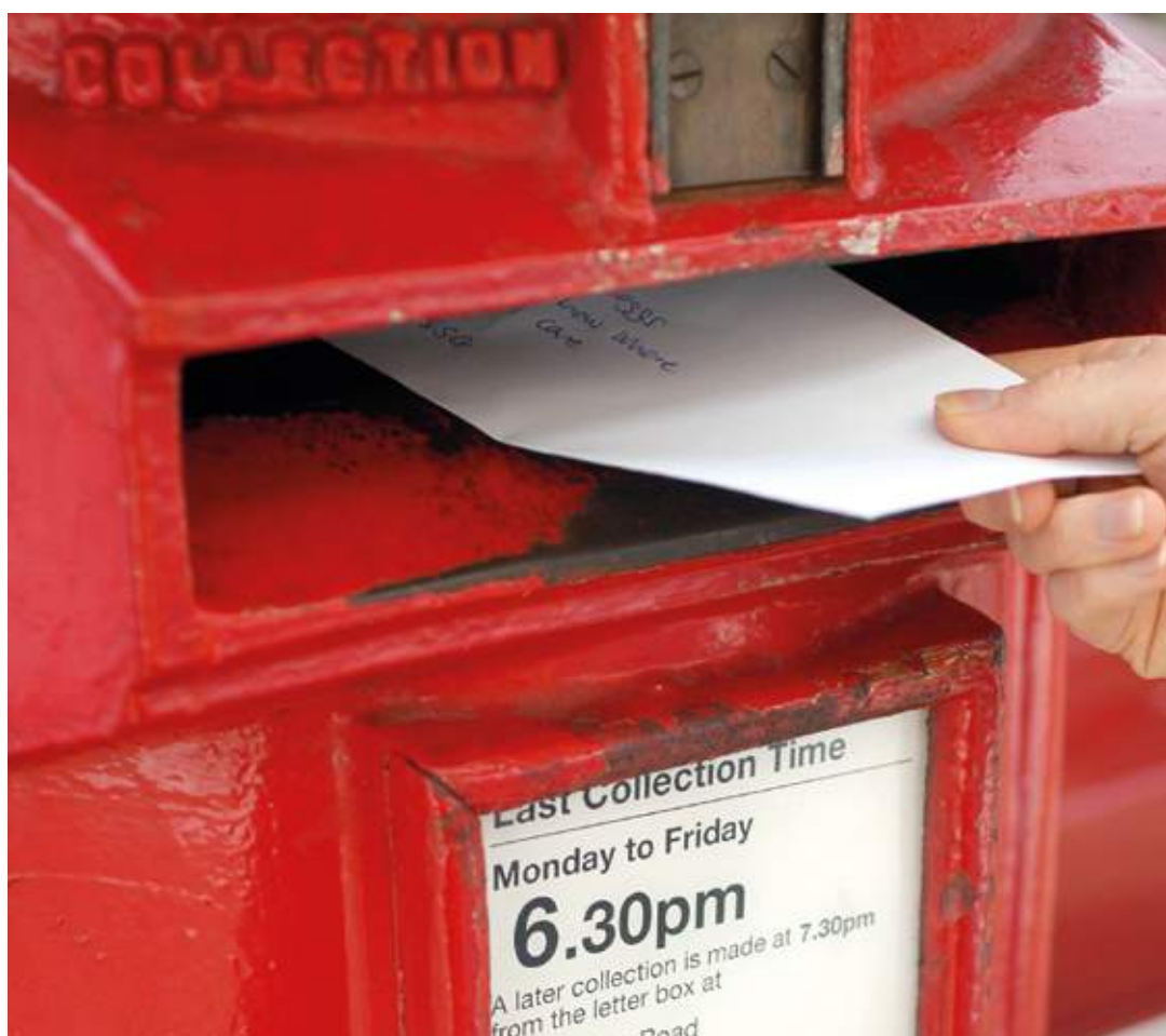
By taking campaign actions, such as writing to companies and MPs, calling for change, citizens can make a difference.

While the lion's share of responsibility lies firmly at the feet of the MNCs and high-income governments, each person and community has a role to play in tackling the plastic pollution crisis. Indeed, as Tearfund has observed: 'When extraordinary things are achieved against apparently impossible odds, it's often because of a shift in values and a civil society movement that pushes for change.' 214