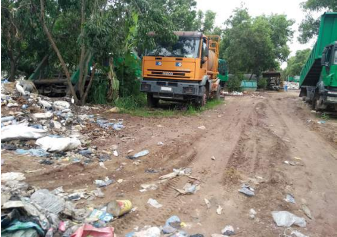
📷 Maintenance has ceased at this sanitary landfill site. There are no other sanitary landfill sites in DRC.

Kinshasa, a city of some 12 million people, is the capital of DRC, one of the poorest countries in the world with a per capita GDP in 2014 of just 479 USD.