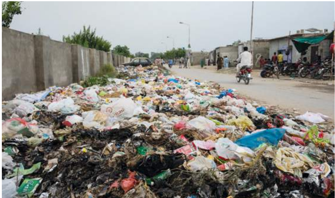
❏ Islamabad, Pakistan. The take-make-dispose model of economic development has been exported across the globe by high-income countries.

Current economic models, with large subsidies given to the oil and gas sectors (virgin plastic is made from crude oil and natural gas), depress the price of plastic – driving supply. The G7 alone shell out 100 billion USD per year in subsidies to the production and use of coal, oil and gas. 170