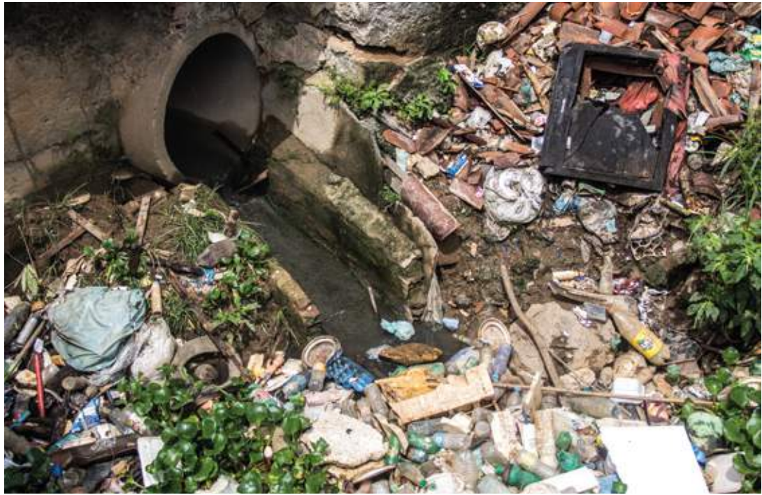
📷 A drainage channel blocked with plastic waste, Brazil.