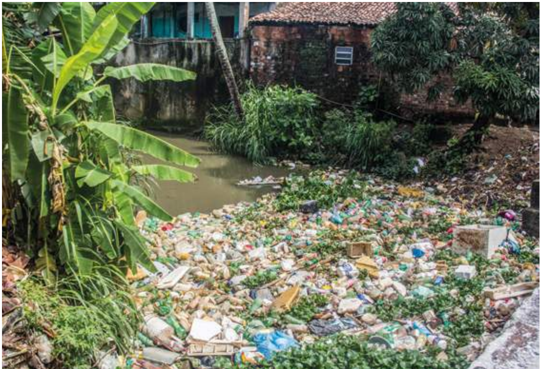
📷 The river Tejipto, in Recife, Brazil, is clogged with plastic waste. Tearfund partner, Instituto Solidare, have a project called 'clean river, healthy city', which is working to clean up the river.

Plastic pollution is creating a growing public health emergency in many towns and cities around the world. New research by Tearfund suggests that between 400,000 and 1 million people die each year in developing countries because of diseases related to mismanaged waste. 2 At the upper end that is one person every 30 seconds. Mismanaged waste, including plastics, harms people's health in developing countries in the following ways: